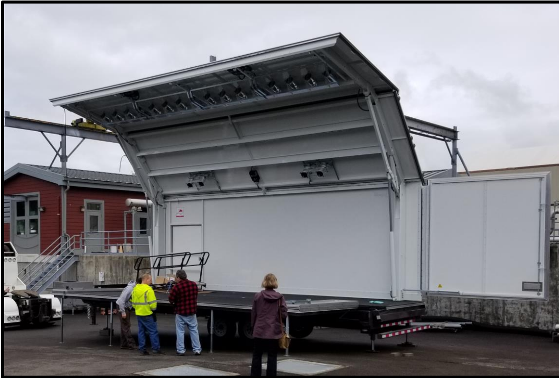
Public Works getting a tutorial on stage operation.

City of Duvall NEWS RELEASE 15535 Main Street NE Duvall, WA 98019 www.duvallwa.gov